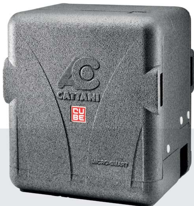
Micro Smart Cube

The unit now operates with a remote keypad that allows visual operation of the machine and user intervention if required. These systems are incredibly reliable: if the machine detects an abnormality either electrically, functionally or mechanically, the units self protection mode will automatically intervene, this helps preserve the unit from any damage that could potentially ensue. Once the problem has been rectified or has subsided the machine will automatically resume to normal operation.