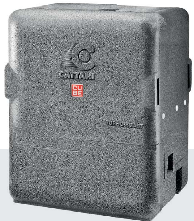
Turbo Smart Cube