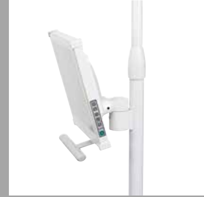
Monitor mount available