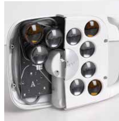
A-dec LED light – Award-winning silent design incorporates unique “passive cooling” to dissipate heat without a fan.