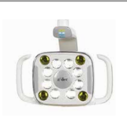
A-dec 500 LED