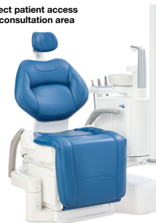
Perfect patient access and consultation area