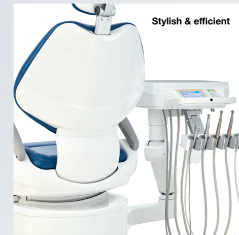
Stylish &amp; efficient