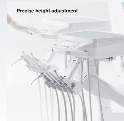
Precise height adjustment