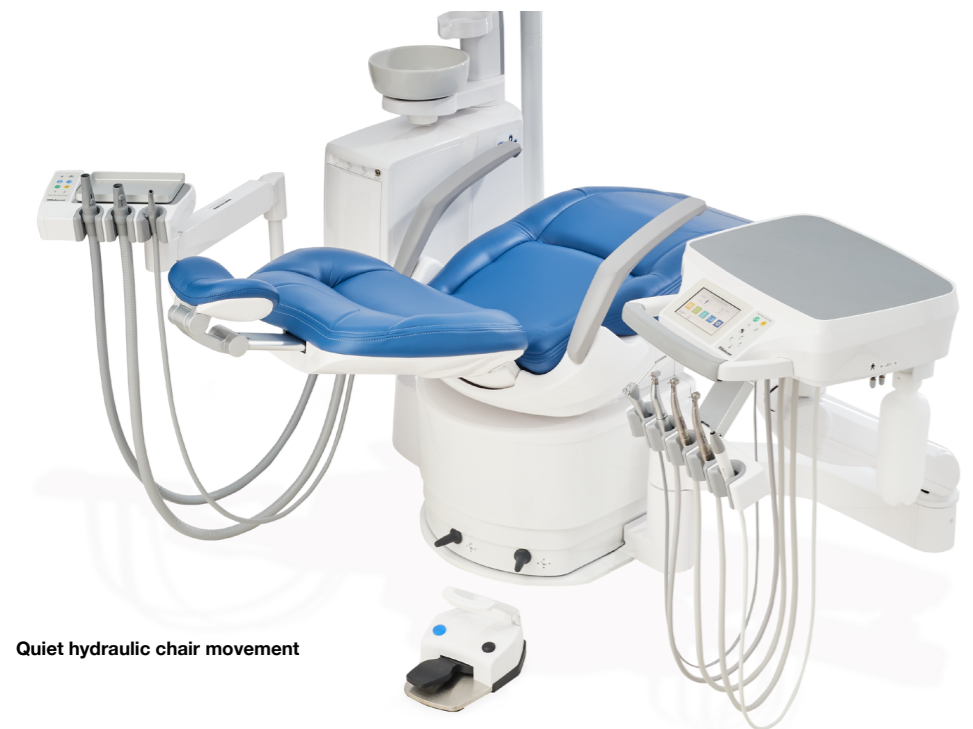
Quiet hydraulic chair movement