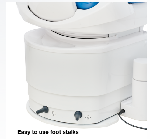
Easy to use foot stalks