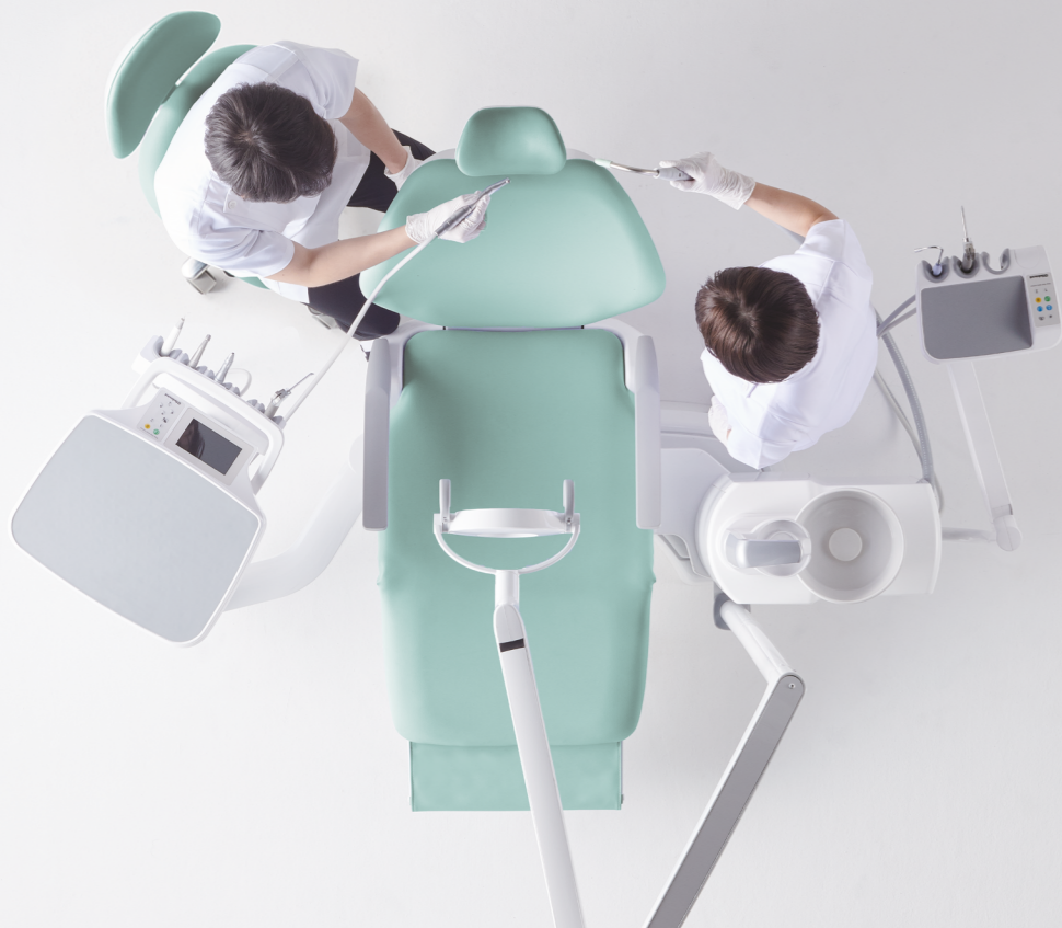
Greater freedom of movement for dentist and assistant