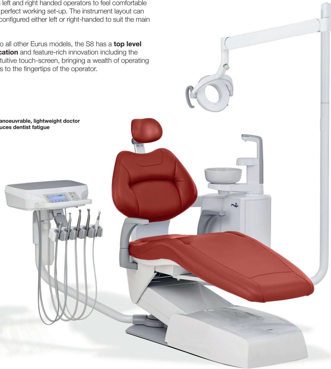
Eurus S8 holder type

Highly manoeuvrable, lightweight doctor table reduces dentist fatigue